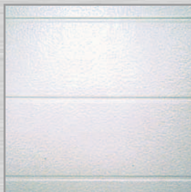
Ribbed Panel Design

Panels are prepainted inside and out to inhibit rust. Hot-dipped, galvanized steel is painted with primer and given a tough oven-baked polyester top coat, to provide the most rust-resistant steel door available. Ten year warranty against rust-through.